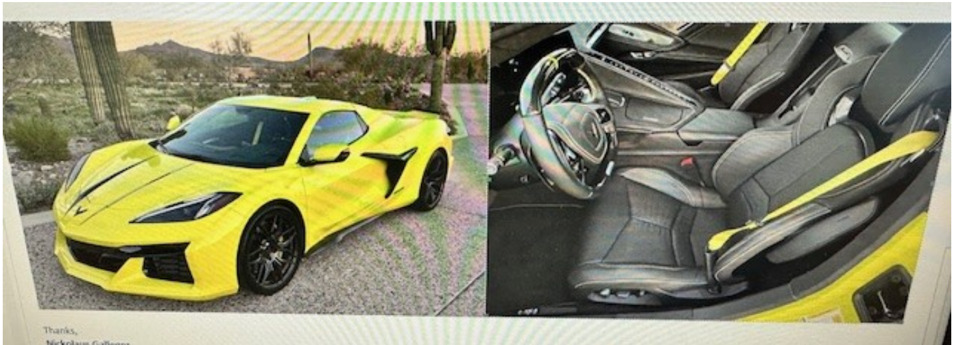
Thanks, Nickerlason Collinson

Denny Renko at Freeway Chevrolet, 2024 C8 Z06, Yellow, CONVERTIBLE , 1300 miles, $164,000, no second sticker.